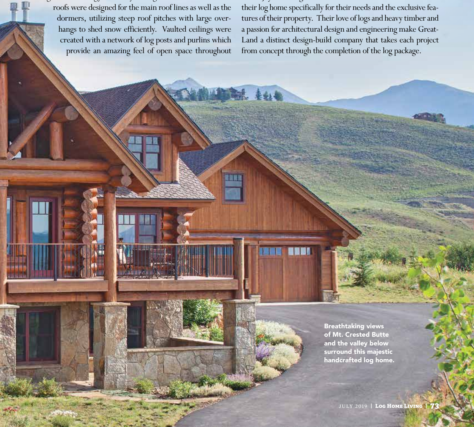
Breathtaking views of Mt. Crested Butte and the valley below surround this majestic handcrafted log home.

GreatLand Log Homes is known nationwide as a premium custom log home builder that specializes in handcrafted, full-scribed log home and dry-in packages. The team at GreatLand Log Homes has spent the last 30 years fine-tuning their craft and enjoys working hand-in-hand with each customer to tailor their log home specifically for their needs and the exclusive features of their property. Their love of logs and heavy timber and a passion for architectural design and engineering make GreatLand a distinct design-build company that takes each project from concept through the completion of the log package.